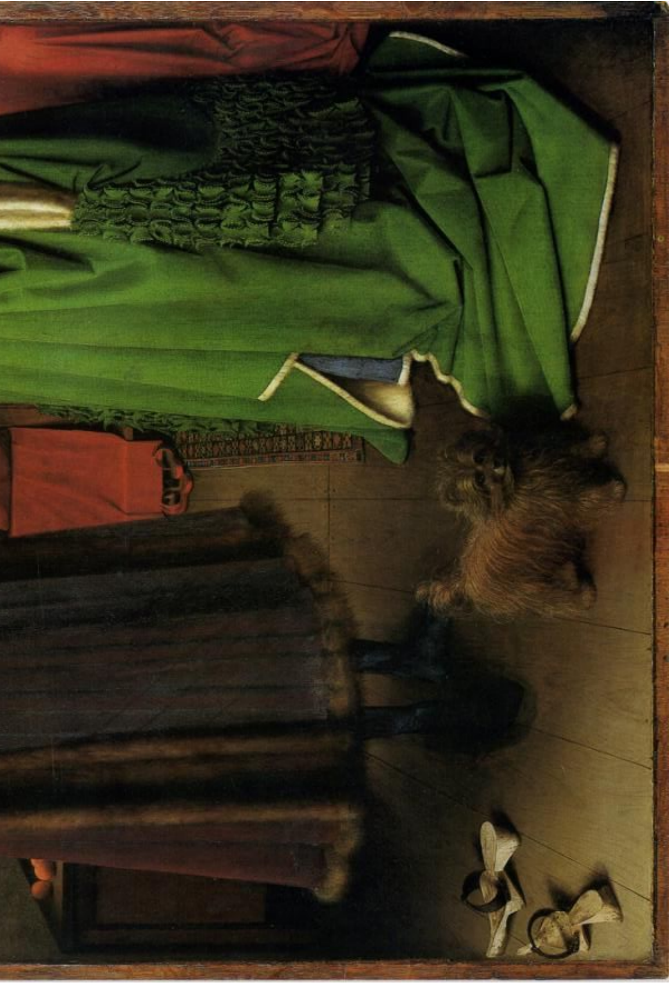
Jan van Eyck, The Arnolfini Portrait , 1434.