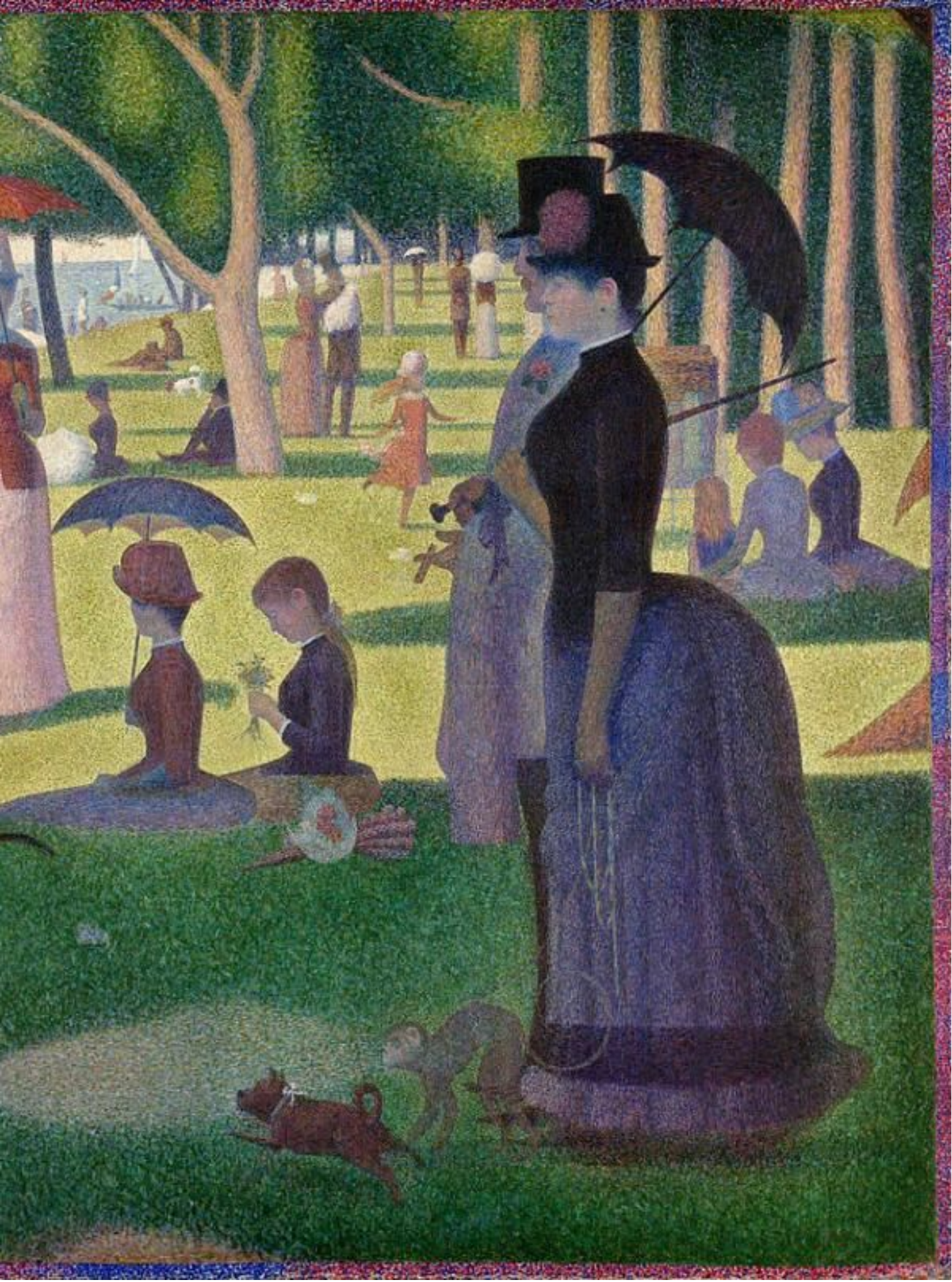
Georges-Pierre Seurat, A Sunday Afternoon on the Island of La Grande Jatte , 1884–1886