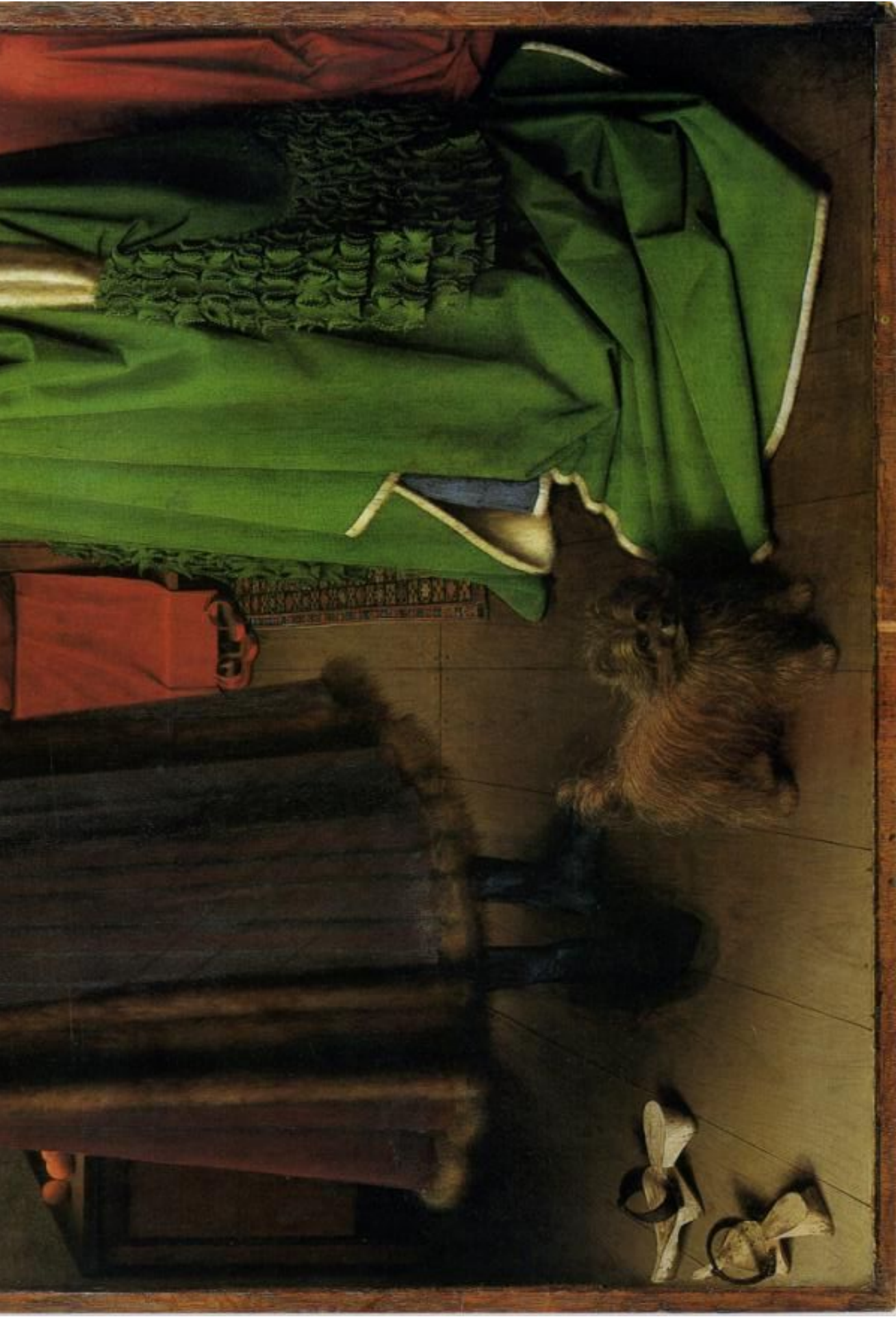
Jan van Eyck, The Arnolfini Portrait , 1434.