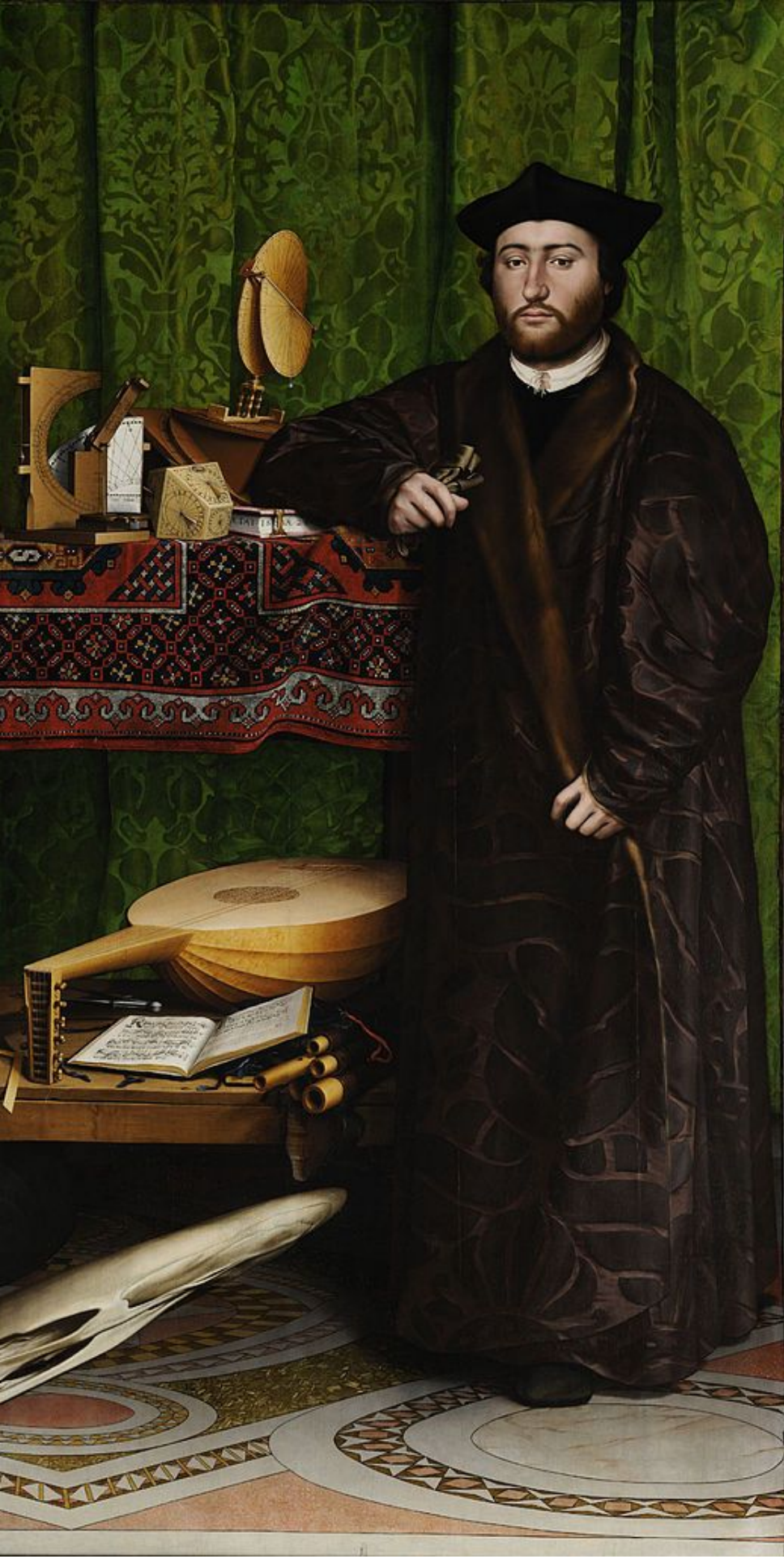
Hans Holbein, The Ambassadors , 1533