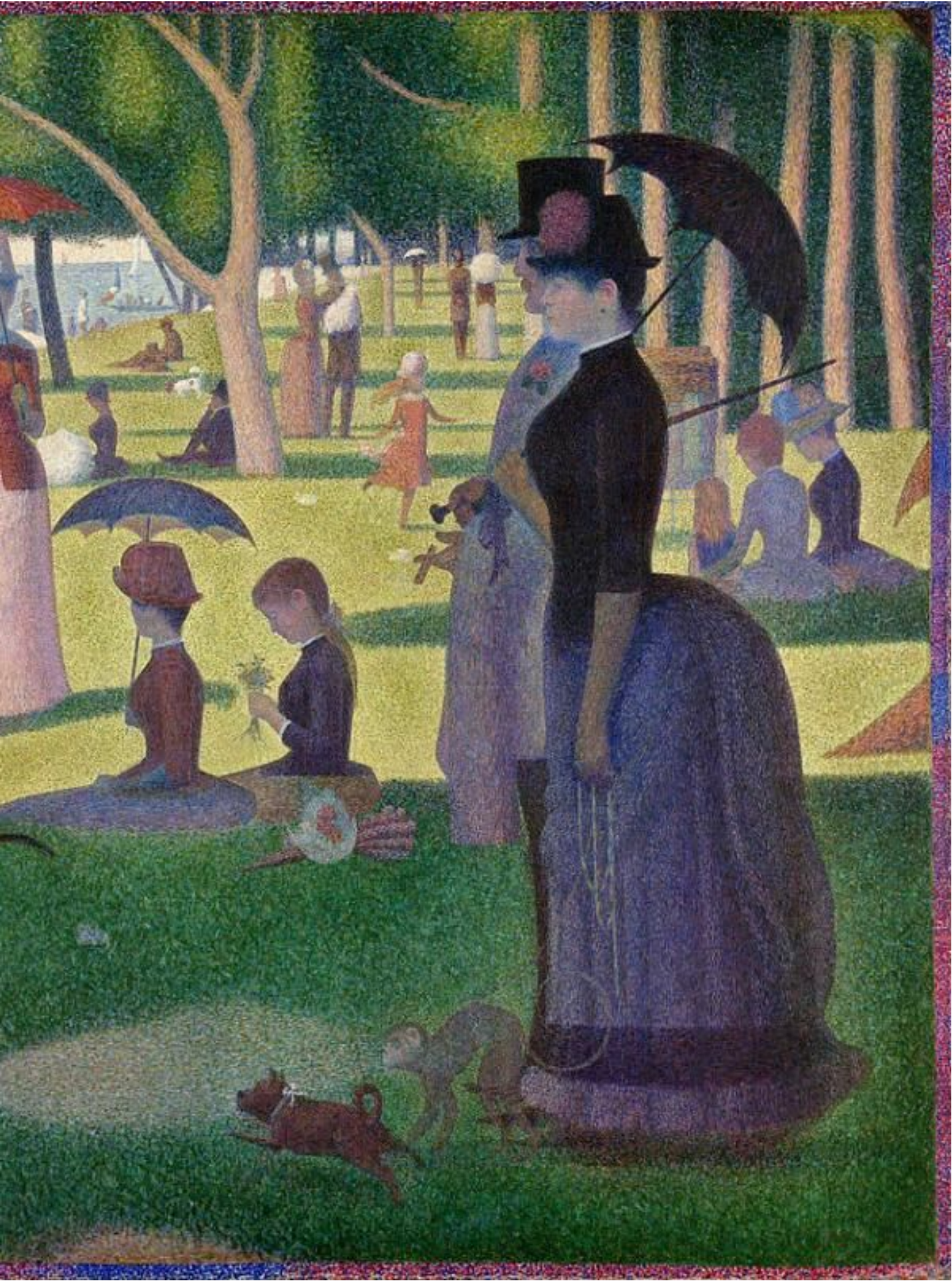
Georges-Pierre Seurat, A Sunday Afternoon on the Island of La Grande Jatte , 1884–1886