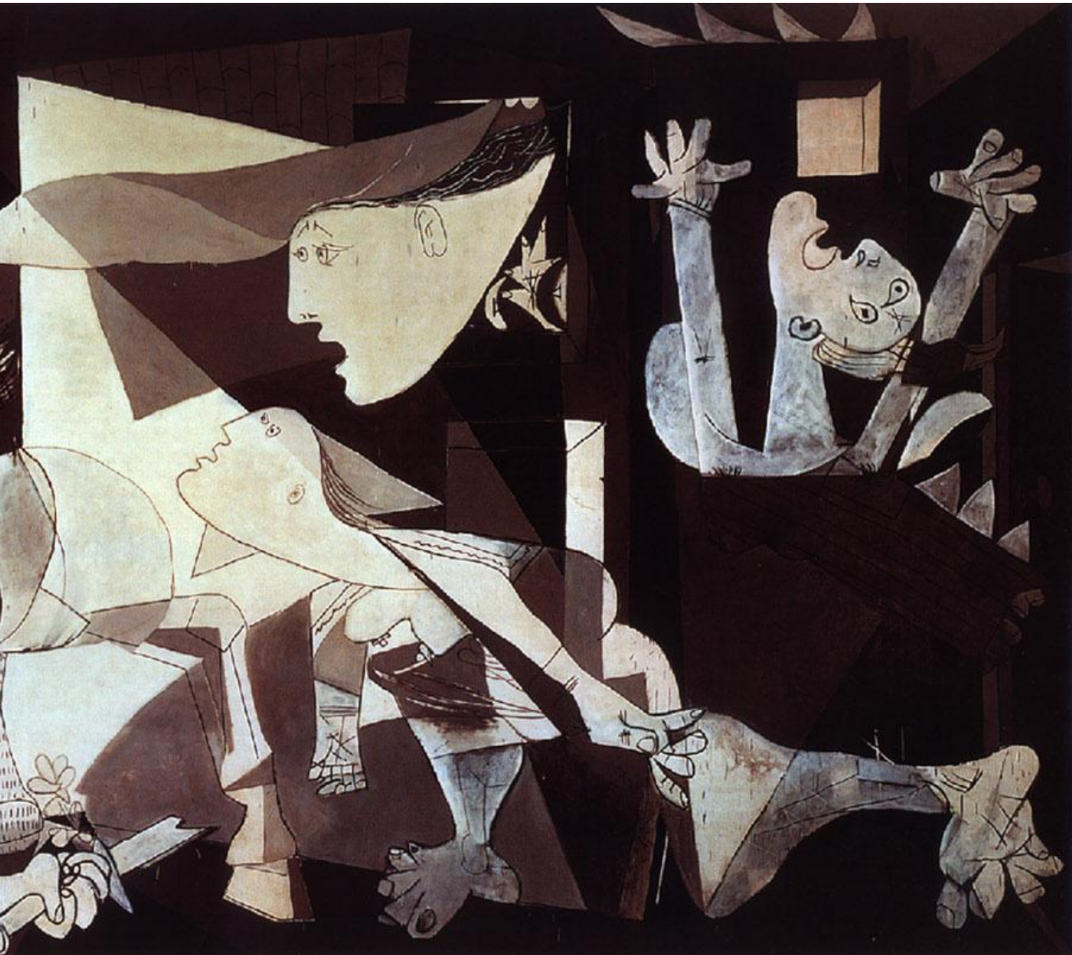
Pablo Picasso, Guernica , 1937