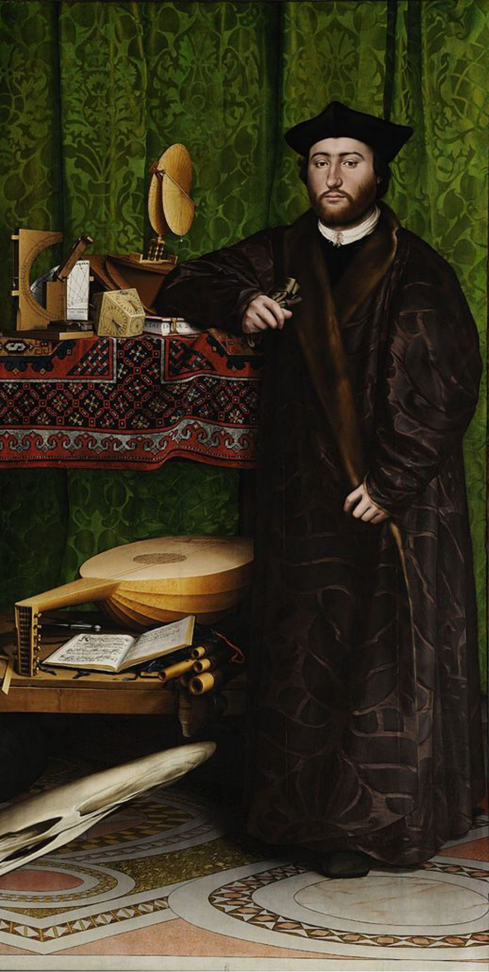
Hans Holbein, The Ambassadors , 1533